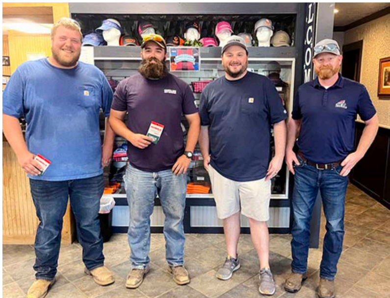
Winning Team: Crossland Heavy Contractors, Inc.

Next year's fundraising event has been scheduled at Powder Creek Shooting Range in Lenexa, Kansas, for Friday, Aug. 23, 2024. 🏹