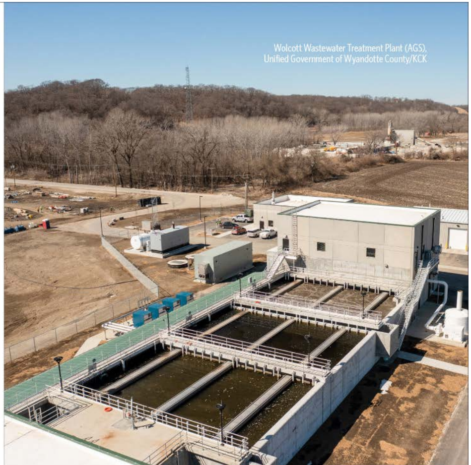
Wolcott Wastewater Treatment Plant (AGS), Unified Government of Wyandotte County/KCK