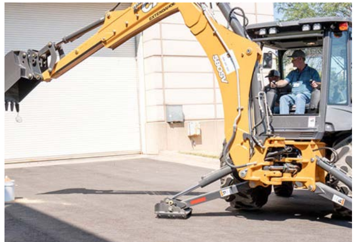
Backhoe Rodeo Competition